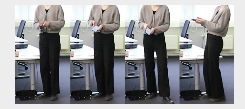
Figure 5: Participant being slightly more mobile while using JoyTilt.

When asked how to map gestures to robot movement, almost all participants had a unique design suggestion. However, some common themes were discerned. The participants that used their whole body when controlling the robot suggested ways of controlling the robot that did not involve a phone. One suggested placing the phone on the body and to map movements from tilting their whole body. Four of the participants were either happy with the design and would not change it or suggested some variation of tilting the phone. Three participants suggested using a joystick instead of a phone in different ways. Nobody expressed the same large and rapid movements expressed prior to development.