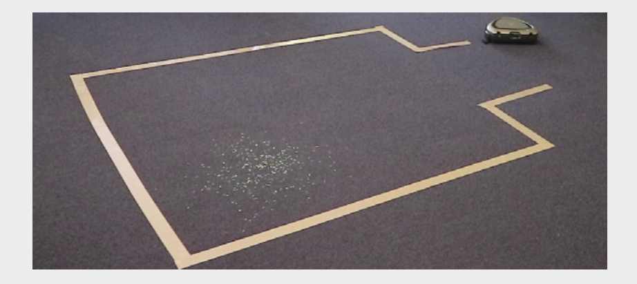
Figure 4: The floor as staged for user testing. Framed as a playful navigation task, the tape represents walls to navigate the robot around, vacuuming rice thrown on the floor.