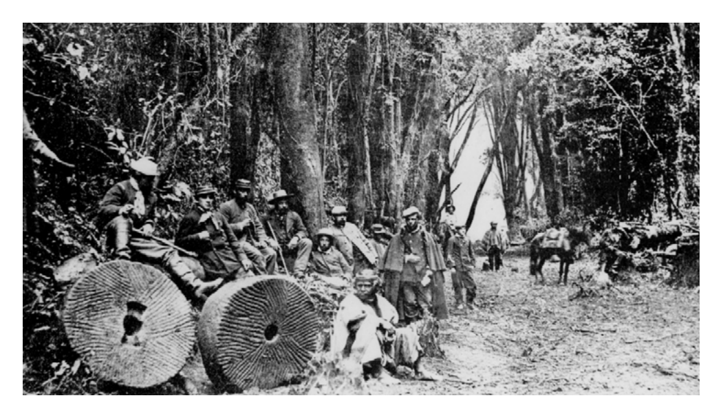
Figure 2. Chilean troops arrive in Villarrica in 1883